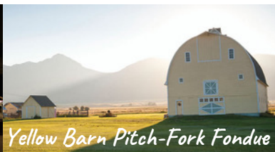
Yellow Barn Pitch-Fork Fondue