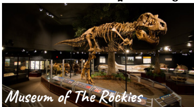
Museum of The Rockies