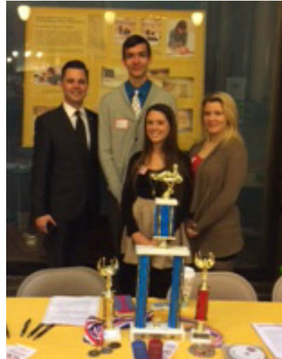
Rep. Zach Nunn with SE Polk students.