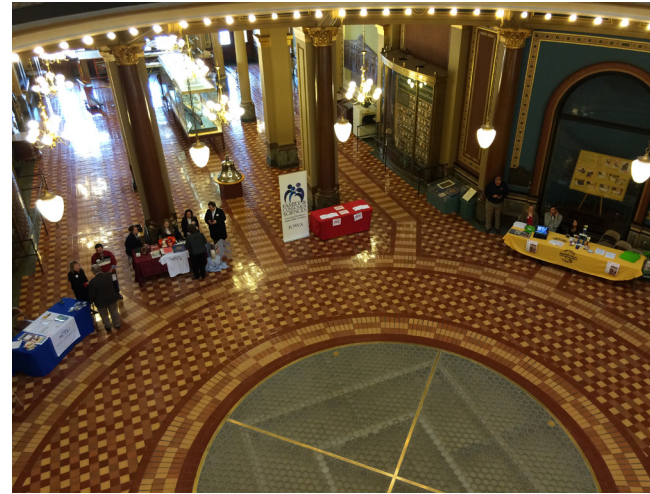
CTE Day at the Capitol, Feb 8, 2016 first floor of the Rotunda.